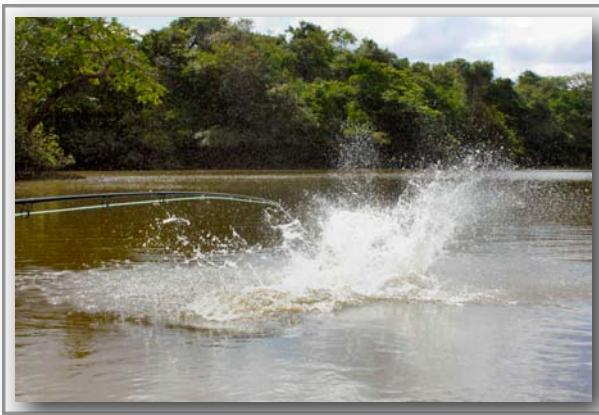
Splash from one hooked fish, Guyana