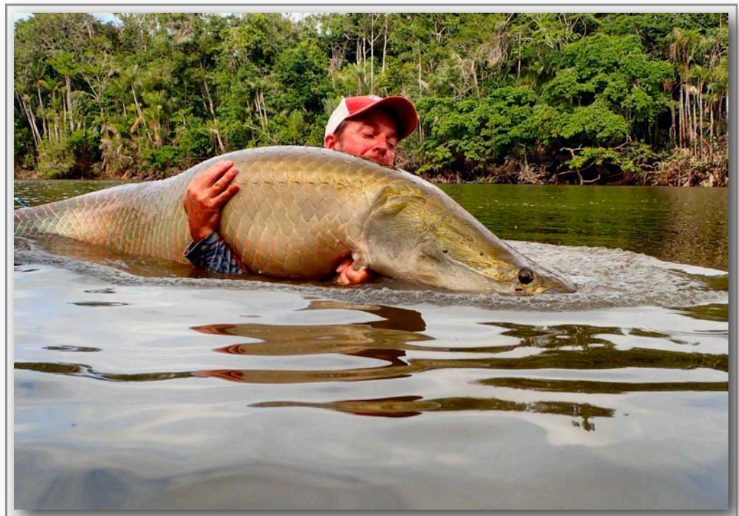
Arapaima in a rainforest river, Guyana