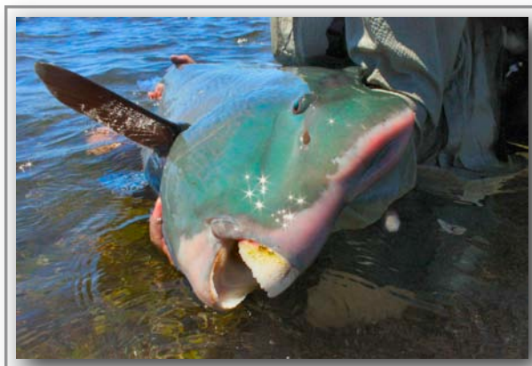
Bumphead Parrot fish, the Seychelles