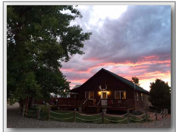
The Leaning Tree Lodge at sunset.