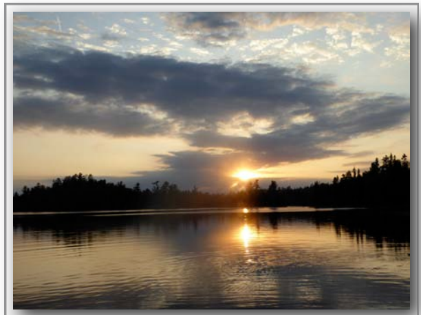
Sunset on Yoke Lake