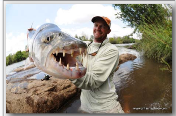
22 lb. Tigerfish, Tanzania

Jeff’s articles, photographs and artwork have graced the pages of magazines, catalogs, brochures and books. He is the author of Currier’s Quick and Easy Guide to Saltwater Fly Fishing and Currier’s Quick and Easy Guide to Warmwater Fly Fishing guide books. These books have become the standard introductions to saltwater and warmwater fly fishing. When not fishing or writing, Jeff is