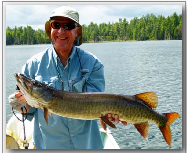
Rich with a nice muskie