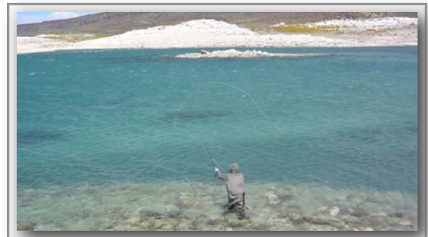
Wind never stopped on Jurassic Lake