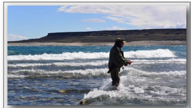
Lake plus 60mph wind = ocean.