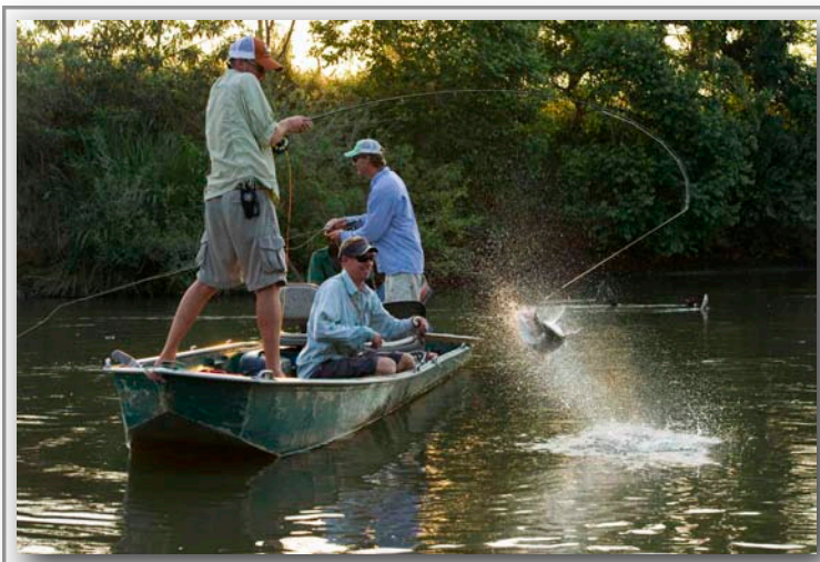
Mnyera River, Tanzania