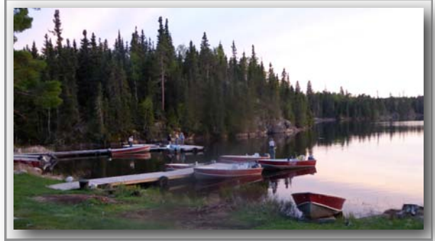
Fishing off the docks at Slippery Winds Wilderness Lodge after dinner.