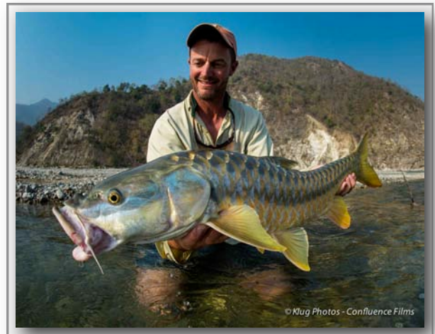
Golden Mahseer, India