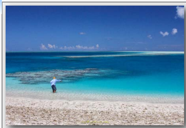
Flats in the Seychelles