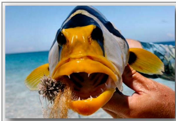
Saddleback Grouper, the Seychelles