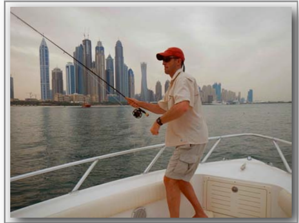
24-hour Layover in Dubai