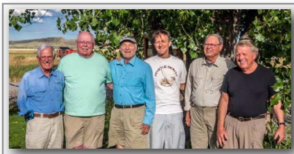
The Bighorn group